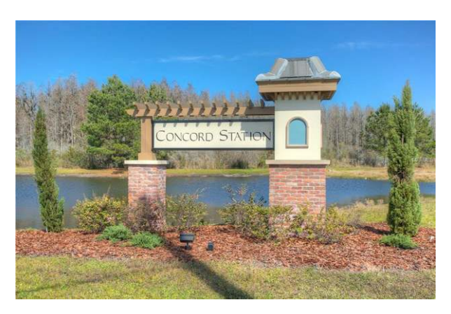
View guidelines and policies for natural areas in the community.