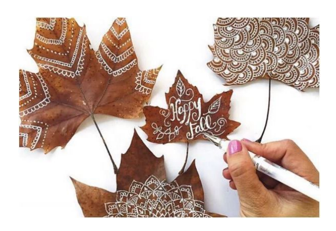
Fall into Crafts Join us this weekend for another family craft day! Sunday, November 5th beginning at 12pm

Thank you to everyone that came out last month to create some fun Halloween crafts!